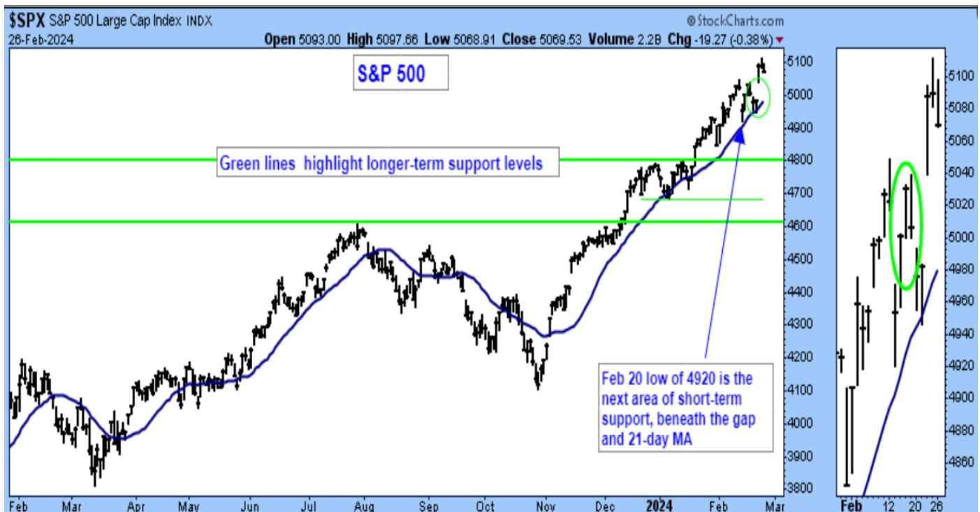
Figure 1: S&P 500 with rising 21-day MA short-term support. | Initial short-term support can be gleaned at both the upside gap (green circle) & rising 21-day MA (blue line, will marginally change each day), down closer to 4980+/- . One guidepost for the strength of the near-term trend is if this area of short-term support will be tested, and how long it takes.

With parts of the Technology complex continuing to underperform short-term (Figure 2), you might have expected the title of this report to be referencing the Japan Stock Market Index/Nikkei 225 Index (often referred to as “Nikki” or “Nikkei Dow”) reaching a new, 34-year high (Figure 3). However, the title has more to do with Wall Street’s infatuation with last week’s EPS report and guidance from NVDA. “The sun did indeed rise in the east,” and specifically in the land of Technology. But again, I point out Figure 2 and the fact that the current domestic equity market uptrend has been more about the “Index Movers” instead of all about AI or Technology. As it currently stands, I view this as supportive of Large Cap equities , implying okay upside participation.