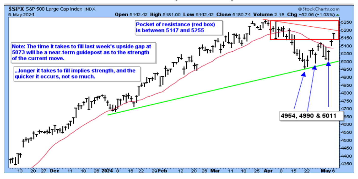
Figure 2: S&P 500 (SPX) – daily data. | Amid the midpoint of a pocket of overhanging selling pressure, until the influence of interest rates on the short-term direction on equities subsides, or until resistance is decisively broken, expect more of the same—rangebound trading.

late March and mid-April—a small price correction. It is also around the same level it was in early/mid-March—a time correction.